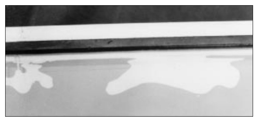
Delamination is a common but repairable type of damage.

After relamination is completed, transparencies are polished and matched to their original frames and reassembled.