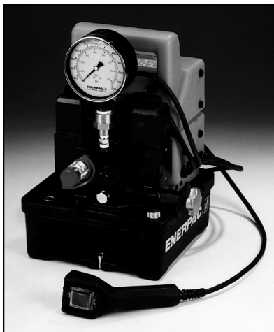
Enerpac Portable Pump

For more information: Enerpac, 6101 North Baker Rd., Milwaukee, WI 53209 U.S. Telephone: +1(414) 781-6600.