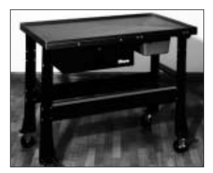
Fluid Containment Bench

Excess fluids flow through a drain into a removable 3.0-U.S.-gallon (11.4-liter) storage receptacle. The bench's legs are welded and braced for strength, and a