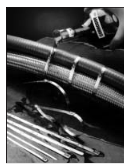
Stainless Steel Ties

The ties can be installed by hand and have an integral self-locking mechanism. They are offered in lengths of 5.0 inches to 47.0 inches (12.7 centimeters to 119.4 centimeters).