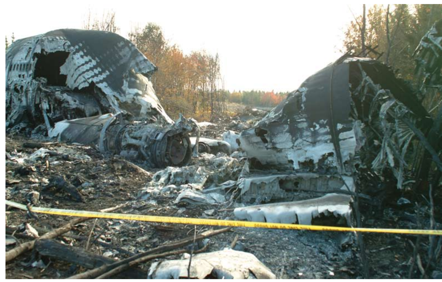
Transportation Safety Board of Canada

On the loadmasters' page, the notice said, "When closing the weight-and-balance page,