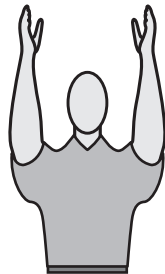
Straight Forward or Back