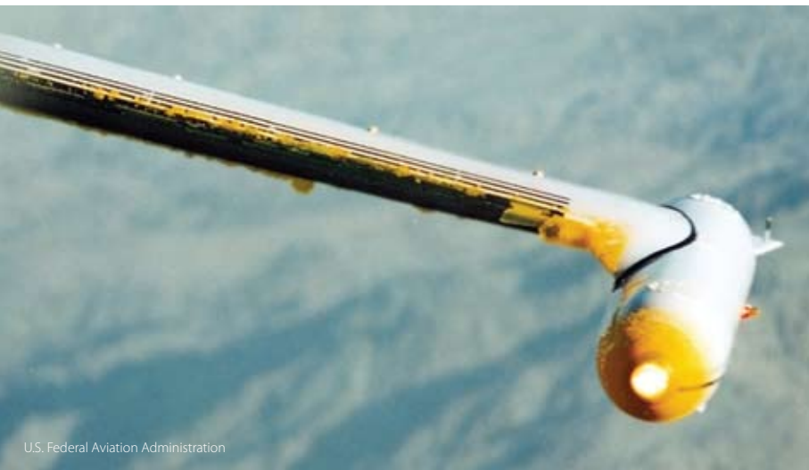
U.S. Federal Aviation Administration

The investigation revealed that about a year before the accident, Embraer had revised the AFM to advise pilots to activate the boots at the first sign of ice accumulation. NTSB found, however, that because of concern about ice bridging, Comair and six of the nine other operators of Brasilias in the United States had not incorporated the revision into their procedural guidance. Comair’s flight standards manual (FSM) said that pilots should not activate the boots until 1/4 to 1/2 in of ice accumulates because premature activation could “result in the ice forming the shape of an inflated deice