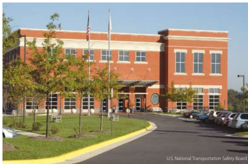
U.S. National Transportation Safety Board

In its final report on the accident, the NTSB said that the probable cause was “an explosion of the center-wing fuel tank (CWT), resulting from ignition of the flammable fuel/air mixture in the tank.” The investigation did not identify the source of the spark that touched off the explosion, but the report said that the most likely source was “a short circuit outside of the CWT