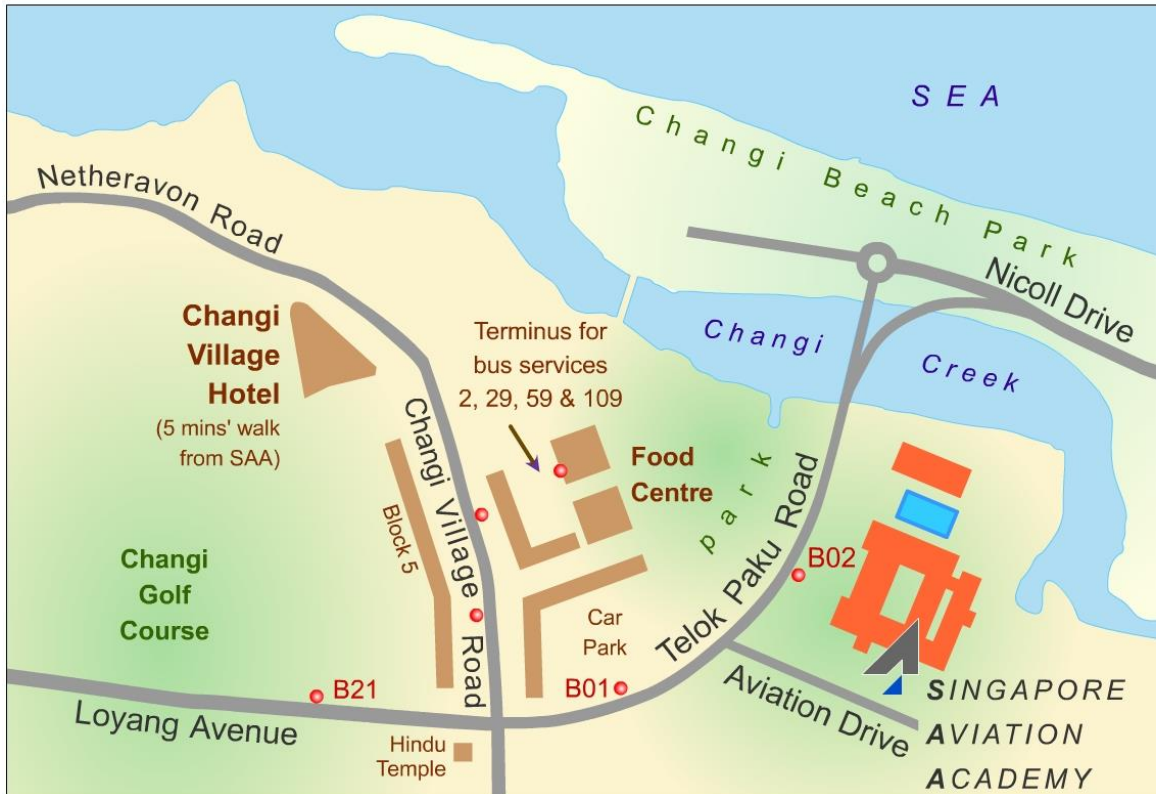
Map of Changi Village where Singapore Aviation Academy is located

● Bus Stop and its identifier. Buses services 9, 19 and 89 ply along Telok Paku Road to/from Airport Cargo Complex.