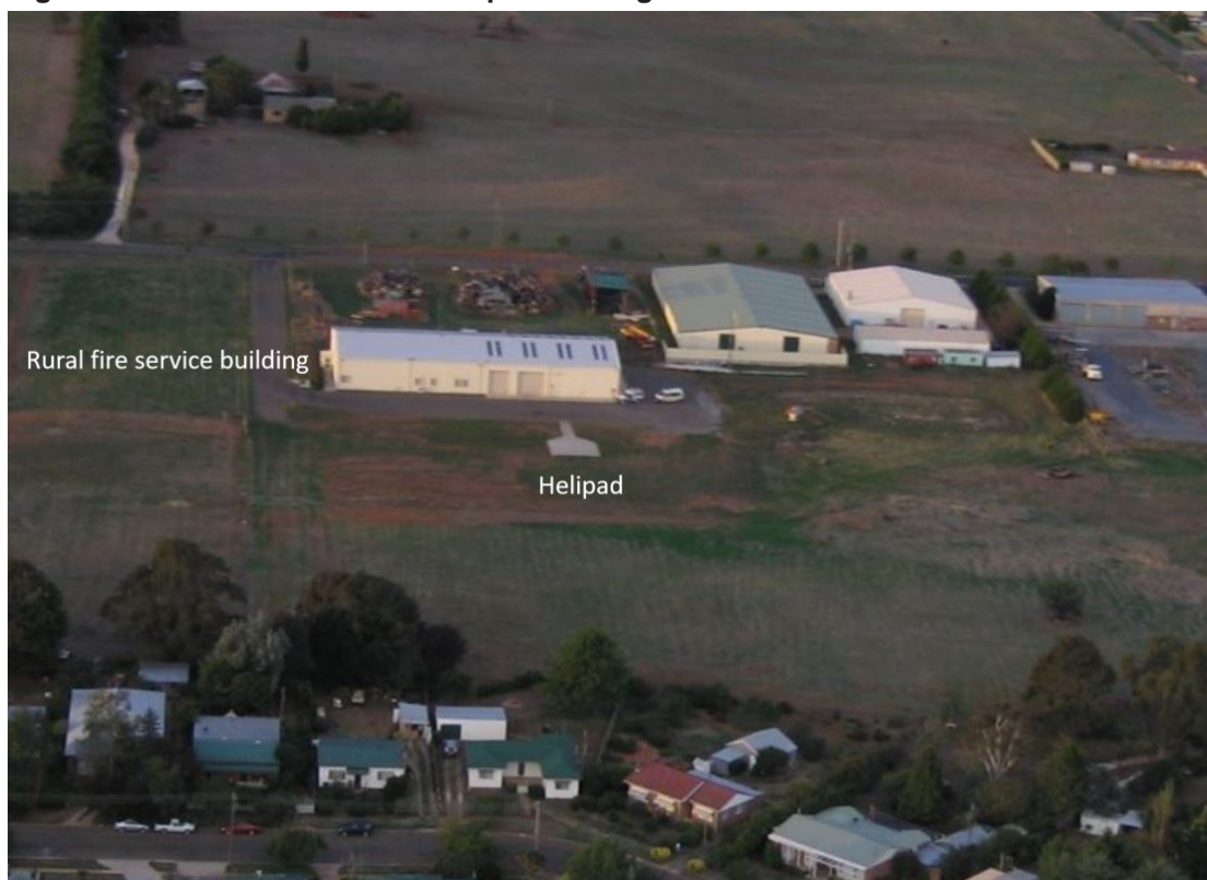
Figure 4: Crookwell Medical helicopter landing site