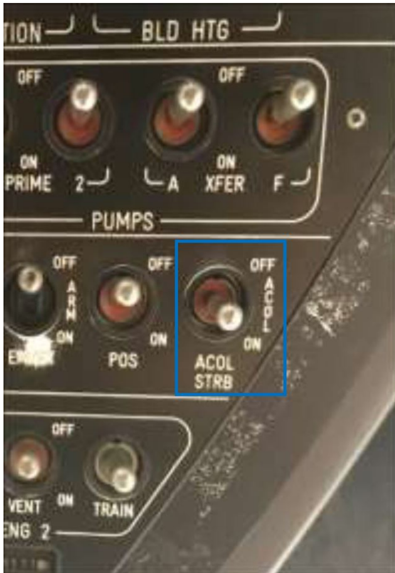
Figure 2: VH-SYB's anti-collision / strobe light switch