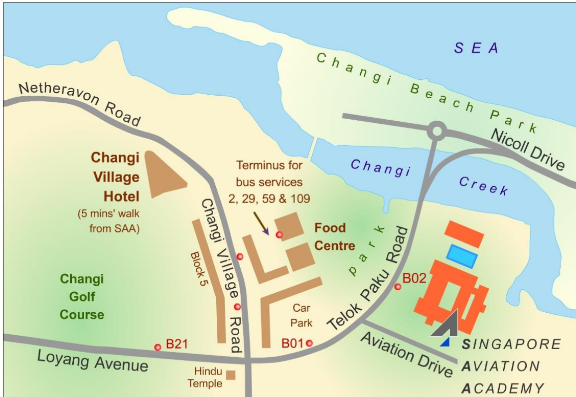
Map of Changi Village where Singapore Aviation Academy is located

● Bus Stop and its identifier. Buses services 9, 19 and 89 ply along Telok Paku Road to/from Airport Cargo Complex.