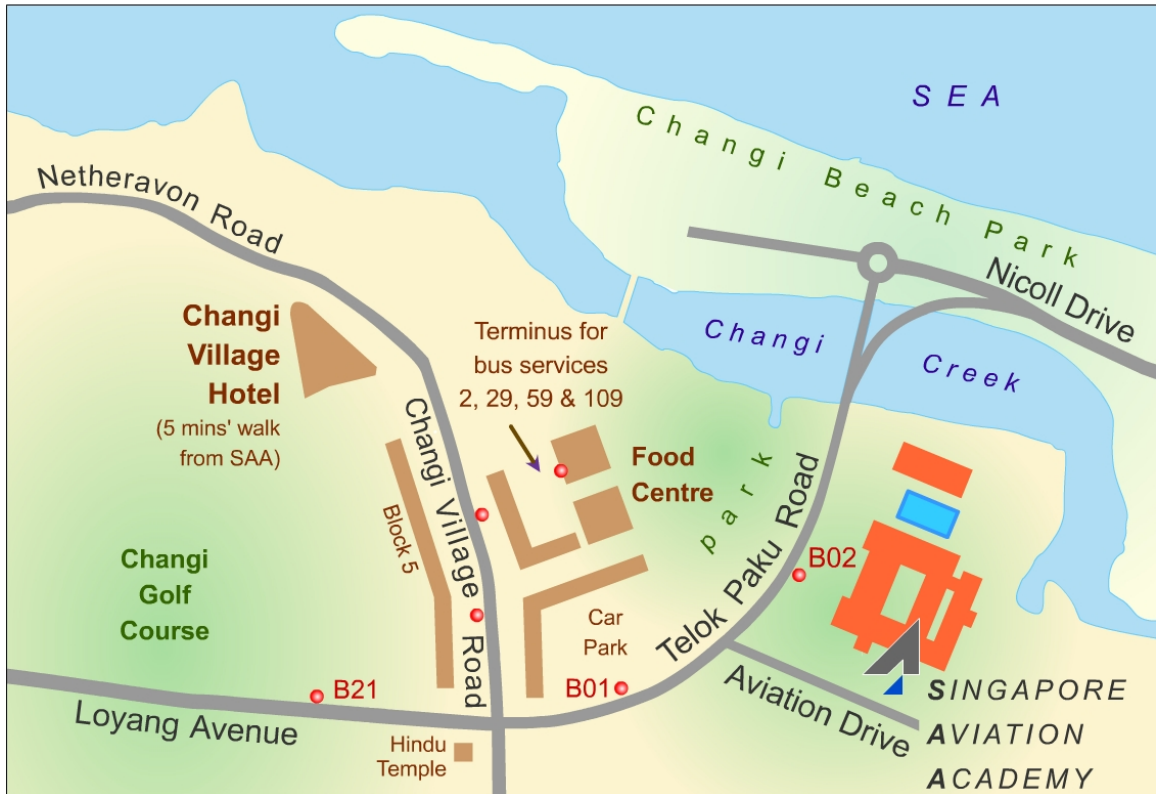
Map of Changi Village where Singapore Aviation Academy is located

● Bus Stop and its identifier. Buses services 9, 19 and 89 ply along Telok Paku Road to/from Airport Cargo Complex.